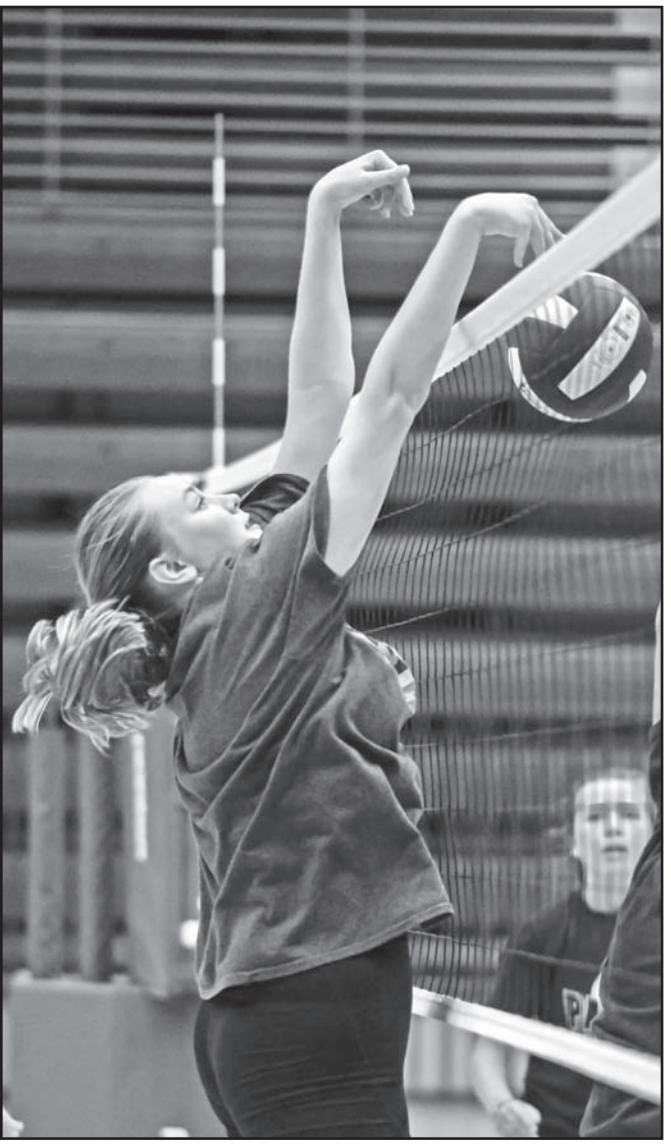
Union County volleyball during its two-hour workout at the UCHS gymnasium last Thursday morning.